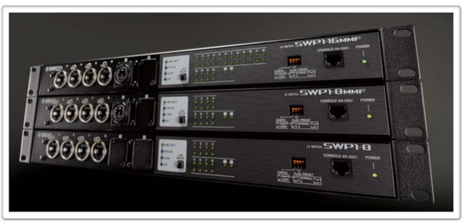
Yamaha SWP1 range of Network Switches

Yamaha SWP1 switches are known to work correctly with their "DANTE CONFIG" enabled. Use these for a more stable and reliable experience. They include the "IGMP Snooping" function which is automatically setup by default, as well as providing some additional useful network monitoring tools.